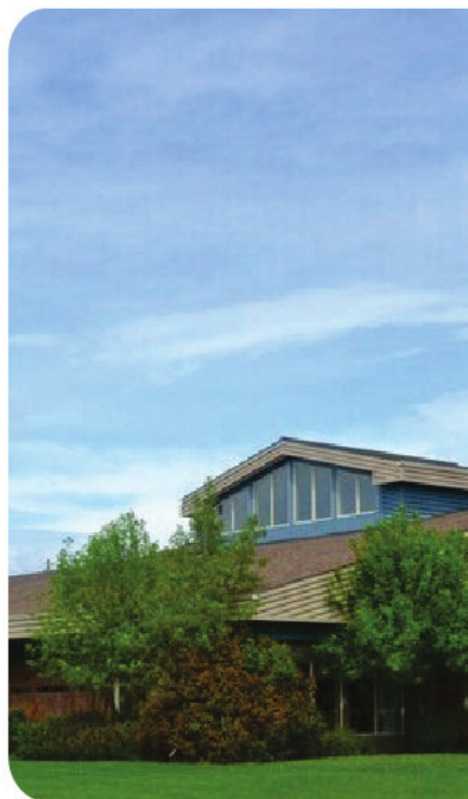
Kamsack Comprehensive Institute (KCI)

Students will team up with our VR specialists to jointly develop immersive virtual resources tailored to students' needs, preserving the wisdom and narratives shared by Elders in a timeless format. This approach not only revitalizes traditional teachings and language but also promotes student mental health and well-being. This initiative will also provide students an opportunity to earn a post-secondary micro-credential from Saskatchewan Polytechnic. The participating youths' sense of belonging will flourish with the opportunity to immerse themselves in a safe, collective environment that encourages relationship-building and self-determination, ultimately resulting in a strengthened sense of school community.